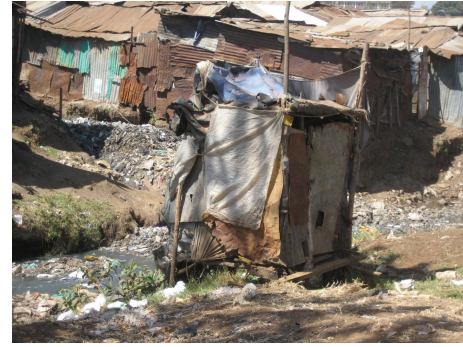
FIGURE 2: Typical Mathare toilet.

According to a study in Nairobi's Kibera slum, over 36% of slum dweller women report being physically forced to have