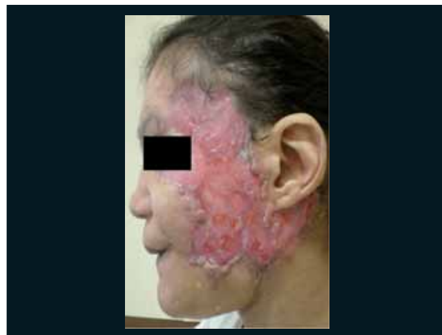
Figure 2. Face ulcer after treatment.