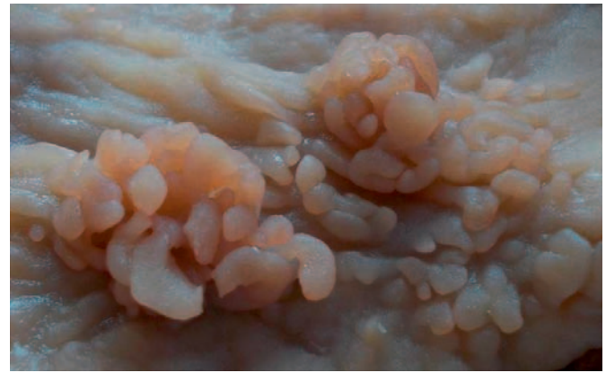
Fig. 2. Macroscopic findings of the resected colon. Numerous finger-like polyps aggregating in the right colon are evident.

The pathogenesis of FP is uncertain. Polyps may result from repeated mucosal injury (such as in IBD) [6, 7], or they may be secondary to peristalsis and fecal stream traction on the mucosa. Oakley et al. [1] suggested that pathogenesis may be more hamartomatous in nature because neuromuscular and fibrovascular hyperplasia/disarray within the stalk were observed in their case series. Other authors have proposed that a localized response to cytokines and growth factors generated by inflamed mucosa may lead to polyp formation [8].