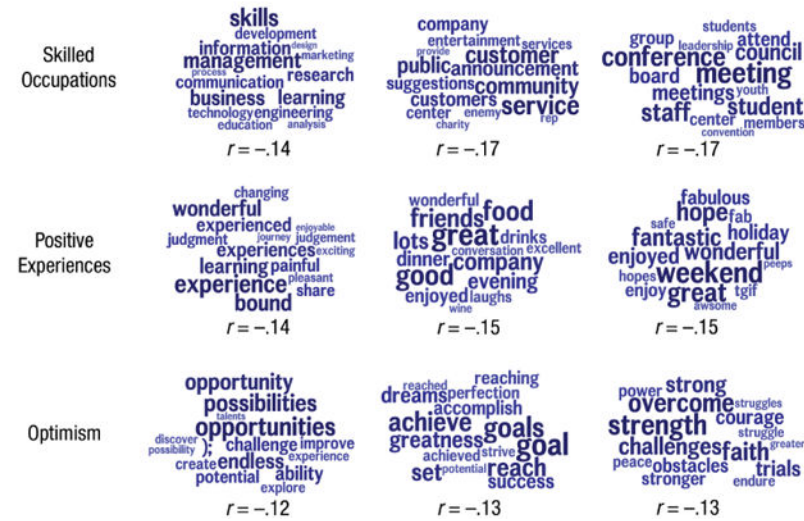
Fig. 1. Twitter topics most correlated with age-adjusted mortality from atherosclerotic heart disease (AHD; significant at a Bonferroni-corrected significance level of p < 2.5 \times 10^{-5} ). The topics with positive correlations (top) and the topics with negative correlations (bottom) have each been grouped into sets, which are labeled at the left. The size of the word represents its prevalence relative to all words within a given topic (larger = more frequent; for details, see the Supplemental Method).