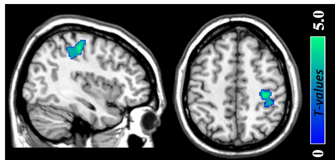
Figure 1 | Gray matter volume reductions in the regions of right inferior parietal lobule and postcentral gyrus (peak MNI coordinate: 36, -25, 49; t = 4.91 , p (corrected) < 0.05 ) among young women with subthreshold depression as compared with non-depressed controls. The color density represents the T score.

Consistent with our hypothesis, amygdala volume alterations were observed in young women with StD. Unlike reports of decreased GMV of amygdala in patients with MDD 5,26 , the present study observed increased GMV of amygdala among young women with StD as compared with NCs. In fact, the amygdala findings are highly inconsistent among studies on depression 6 . However, most structural imaging studies on populations at risk for depression found greater amygdala volume than NCs 12,13 , which is in line with our findings. In addition, recent studies have found the association between increased amygdala volume and heightened negative affect 27 and negative memory bias 28 , which are regarded as psychological characteristics and vulnerability factors of depression.