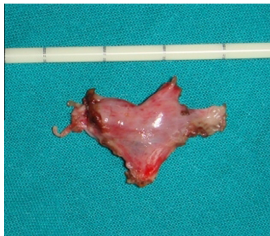
Figure 2 The excised Müllerian structures.

The mean (range) follow-up was 18.2 (3–42) months and clinically, all 32 operated testes retained their scrotal positions. One right testis was high scrotal; the patient