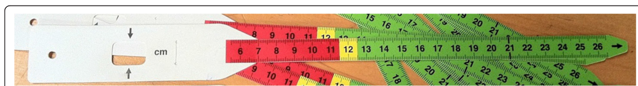
Figure 1 MUAC tape ($0.06, UNICEF supply catalogue) showing 3 classes: red, yellow and green.

The planned study method had involved going from home to home, and performing a 5 minutes training session for each mother; however this proved impossible. In both villages, once the objective of showing mothers how to perform MUAC classifications had been explained to the village chief and other leaders, it was considered to be so important that they insisted on calling an immediate meeting of the villagers. Mothers and children formed a seated group around the investigators, circled by the older girls who stood to obtain a good view, with the men and boys standing behind. Each mother did one MUAC measurement on the left arm, followed directly by one MUAC measurement on the right arm of their child. The mother called out the colour classification (eg "Red") and this was noted down by the investigator. This was then repeated by an experienced CHW testing the right and then the left arm of