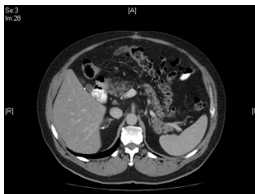
Figure 1 Computed tomography of the abdomen. Computed tomography scan of the abdomen showing mesenteric irregularity and thickness.

We report here on a 62-year-old caucasian male who presented with right upper quadrant abdominal pain for several months prior to his first presentation to our institution in 2005. The abdominal pain was not associated with changes in bowel habits, nausea, vomiting, or constitutional symptoms. Initial investigations including complete blood count, liver and kidney function tests, and abdominal ultrasonography were normal. The patient underwent cholecystectomy in 2005 for possible biliary cause of pain, but the pain persisted after surgery. Subsequently, imaging study using CT imaging scan demonstrated thickening