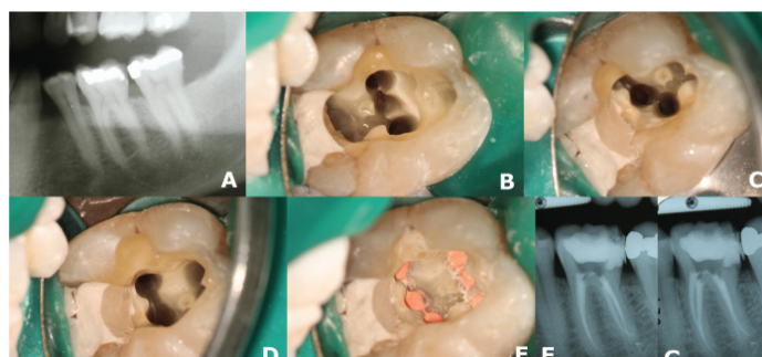
[Table/Fig-1a-1g]: (a) Initial panoramic radiograph. Partial view of the mandibular left side. (b) Pulp chamber view after full instrumentation. Three mesial root canals can be seen. (c) Distolingual and middle distal canals can be seen in the distolingual root. (d) Single canal in the distobuccal root. (e) Pulp chamber view after root canal obturation. (f) Final radiograph after root canal obturation. (g) Final radiograph taken from distal.

Because of the time limitation the therapy was finished in two appointments. The root canals were dried and a paste of calcium hydroxide (Ultracal, Ultradent, USA) was used as intracanal medication. Cavit (Cavit W, 3M ESPE, Germany) was used as a provisional restorative filling between visits. At the second appointment, a final irrigation protocol which included 17% EDTA irrigation followed by a final rinse with sodium hypochlorite was performed. The obturation technique chosen was the continuous wave of condensation technique and AH plus (AH Plus, Dentsply, Germany) was used as sealer [Table/Fig-1e-g]. The pulp chamber was restored provisionally with Cavit temporary filling. The tooth was scheduled for permanent restoration. Although it was not possible to bring back the patient to a proper one year recall, the patient mentioned, during the recall attempt contact, that he remains symptoms free.