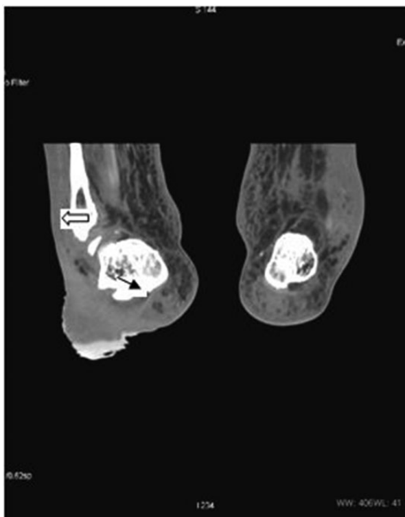
Fig. 3. One hundred and twenty-eight-slice positron emission tomography – computed tomography (PET/CT) scan showing erosions and sclerosis at the right calcaneum (black arrow) associated with soft tissue collection and defect with subcutaneous inflammatory fat changes (white arrow).