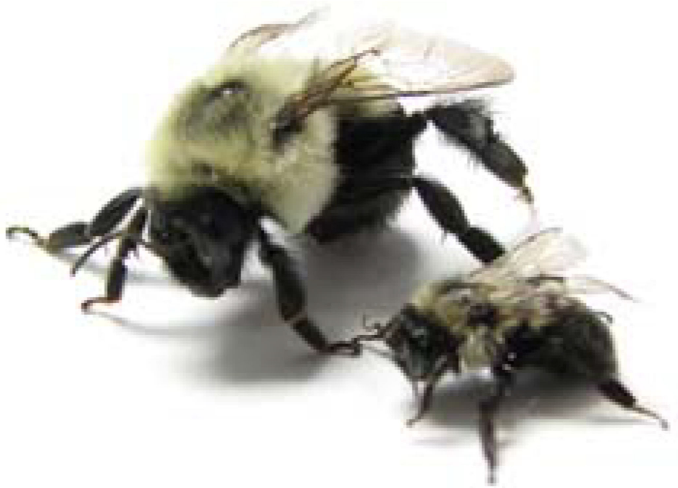
Fig. 1. Though bumble bee ( Bombus impatiens ) workers are highly related ( r = 0.75 ), there may be a tenfold difference in mass between sisters of the same nest