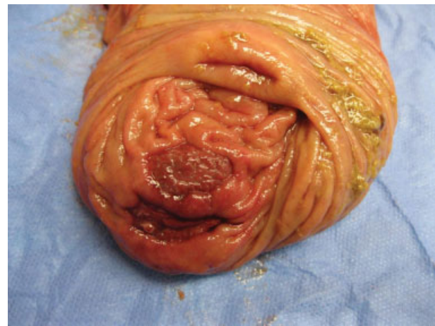
Fig. 3 Right colon and terminal ileum surgical specimen from a patient with gastrointestinal Behcet disease shows focal ulceration in the proximal ascending colon consistent with ischemic ulcer.

Despite subtle differences, distinguishing between both, diagnosis may not be possible.