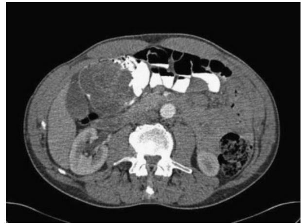
Fig. 1 Computerized tomographic scanning shows a complex inflammatory mass without abscess or perforation in the cecum of a patient with gastrointestinal Behcet disease.

Several imaging modalities can be used to assist the diagnosis of intestinal BD, including barium swallow, barium enema, or computed tomography/magnetic resonance imaging (CT/MRI). 14 CT and MRI scans are useful for demonstrating