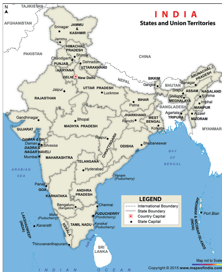
Figure 1. Political Map of India.

have been reported in India, and regional distribution for many conditions historically known, prevalence data and the mutation profiles are not well known for the majority. The underlying population genetic heterogeneity poses significant challenges in this regard. In addition to the complexity and the magnitude of population, the presence of disparity in economical and infrastructural resources at the level of population subgroups as well as individuals further complicates the health care delivery and access to genetic services (Balarajan et al. 2011).