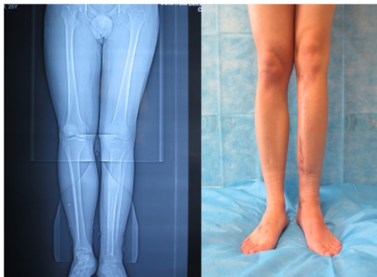
Fig. 5 Nine months after surgery, the affected limb was similar to the unaffected side in length, form, and function

grafts stabilized using an Ilizarov external fixator [30] and arthrodeses with autogenous bone grafts [13, 31, 32]. However, the period for graft union is long, especially in patients with non-vascularized grafts (18 months) [30].