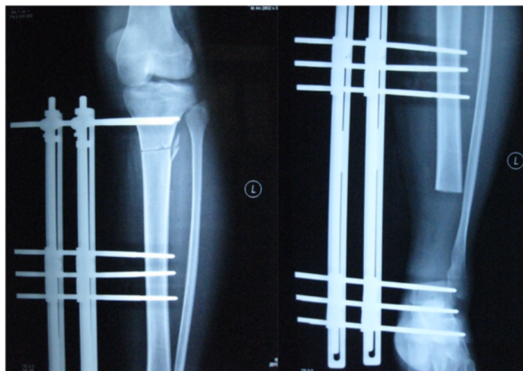
Fig. 3 Distal tibia lengthening with a unilateral external fixator after excision of the tumor