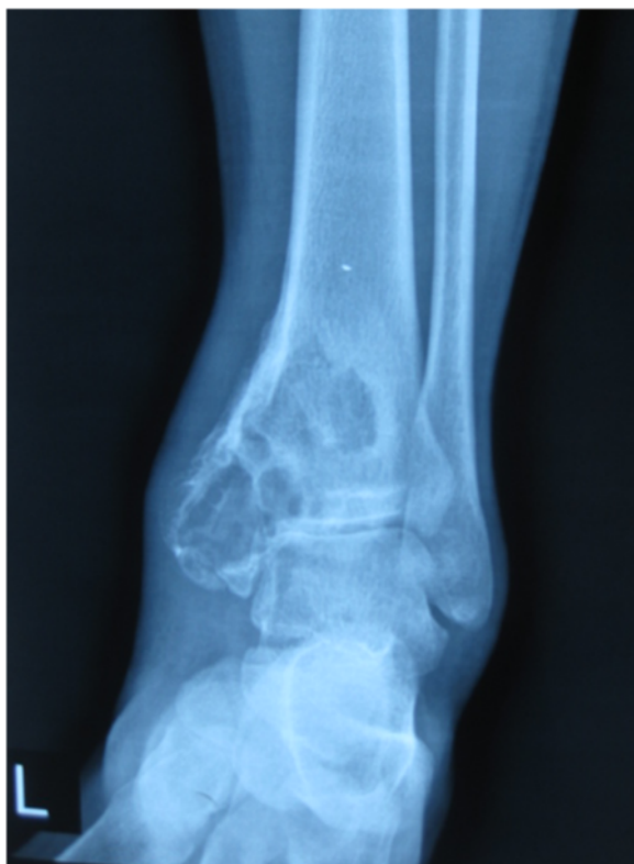
Fig. 1 Radiographs revealing an aggressive lesion of the distal tibia

limb-length discrepancy is minimal (Fig. 5). He has remained disease free for 3 years since the initial surgery and can maintain normal limb athletic function.