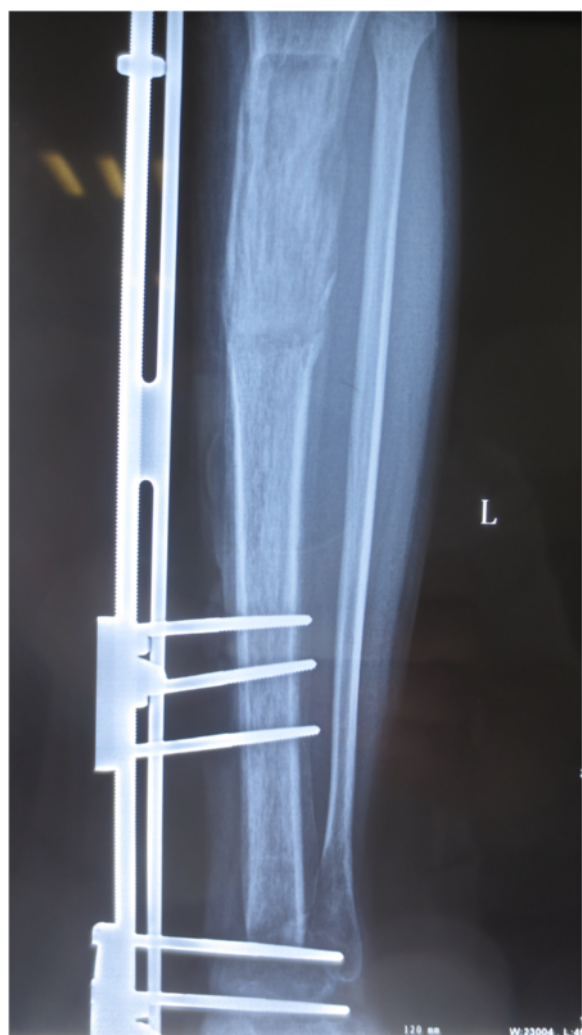
Fig. 4 Ankle joint arthrodesis after bone lengthening

weight-bearing, and rapid restoration of function with a good functional outcome; however, problems such as infection, mechanical failure, and aseptic loosening exist and may limit the long-term survival of the prosthesis, increasing the risk of revision over time [12, 15]. In addition, the lack of soft tissue after wide resection might add to the risk of infection and ultimately amputation. For allografts, there are high rates of complications such as nonunion [16], infection, fracture, degeneration of the articular surface, graft resorption, joint instability, and pathological fractures [16–19]; accordingly, allografts are considered a temporary solution in the management of malignant bone tumors [20]. Moreover, postoperative chemotherapy delays incorporation and union because of negative effects on healing and revascularization [21]. Generally, complications gradually increase over time in limbs reconstructed with tumor prostheses or allografts, and limb function also worsens.