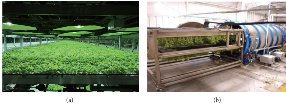
FIGURE 2: N. benthamiana plant growth (a) and agroinfiltration (b) at commercial production scale at Kentucky Bioprocessing LLC.

regardless of whether they were produced under scale-up conditions or with the desiccator [16–19]. This pilot-scale system has enabled us to produce the norovirus vaccine candidate under current good manufacturing practice (cGMP) regulations which is sufficient both in quality and quantity for a phase I human clinical trial [16, 20, 21]. Biotechnology companies have further explored the scalability of this method. For example, a fully automated vacuum system was developed with the capability to agroinfiltrate up to 1.2 tons of plant biomass per day, allowing for the production of up to 75 g of MAb-based therapeutics per greenhouse lot (Figure 2) [1, 15, 22]. This process can be further scaled up, but its requirement of inverting plants grown in pots or trays may impose limitations on the ways the plants can be cultivated and may confine the use of vacuum infiltration to high-value RPs, such as vaccines and therapeutics.