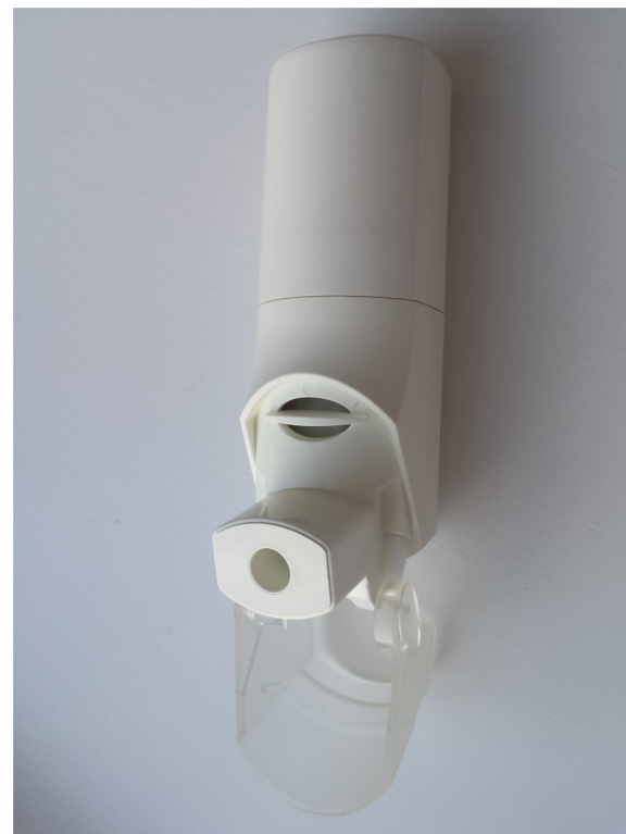
Figure 1 Spiromax device.

The Spiromax® device (Figure 1) is a novel DPI. DuoResp® Spiromax (budesonide plus formoterol [BF] Spiromax) is approved for use in the European Union for treatment of adults ( \geq 18 years old) with asthma and for patients with COPD for whom an inhaled corticosteroid/long-acting \beta_2 agonist (ICS/LABA) combination is indicated [18]. The formulations of BF in BF Spiromax provide comparable quality and are equivalent to BF (Symbicort®) Turbuhaler at equivalent strengths [18]. Regulatory approval of Spiromax was dependent on demonstration of