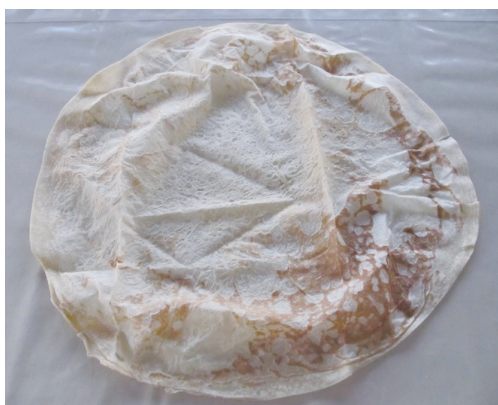
Figure 4 Photograph of Markouk bread. The average sodium content of the Markouk bread is 1,111 \text{ mg}\cdot 100 \text{ g}^{-1} (2.83% salt).