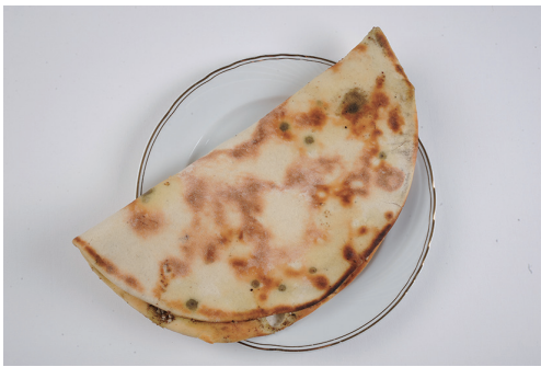
Figure 2 Photograph of traditional Lebanese pies or “Mana’eesh”. The average sodium content of the traditional Lebanese cheese pies (Mana’eesh) is 716 \text{ mg}\cdot 100 \text{ g}^{-1} (1.32% salt).

Another category of high salt foods includes white brined cheeses and strained yogurt (Labneh) which are heavily