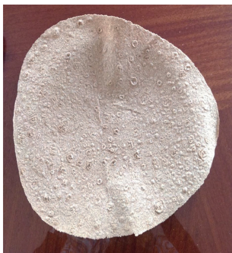
Figure 5 Photograph of Tannour bread. The average sodium content of the Tannour bread is 866 \text{ mg}\cdot 100 \text{ g}^{-1} (2.2% salt).

concerned about the level of sodium in their diet and even less (38%) looked at sodium labels before purchasing food products. However, checking the labels did not seem to translate to a change in the decision of buying the high sodium product because only 44% of the later subgroup admitted it affected their decision. This could be partly explained by the finding that 56% stated that food labels on sodium are not comprehensible. Despite the deficiencies observed, around half of the participants perceived themselves as actively reducing their daily intake of sodium.