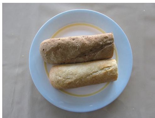
Figure 6 Photograph of white and brown French baguette. The average sodium content of the white and brown French baguette is 821 \text{ mg}\cdot 100 \text{ g}^{-1} (2.1% salt) and 866 \text{ mg}\cdot 100 \text{ g}^{-1} (2.2% salt), respectively.

Intriguingly, women had better knowledge than men on many levels and consequently a more favorable overall attitude and behavior. This finding emphasizes the rationale