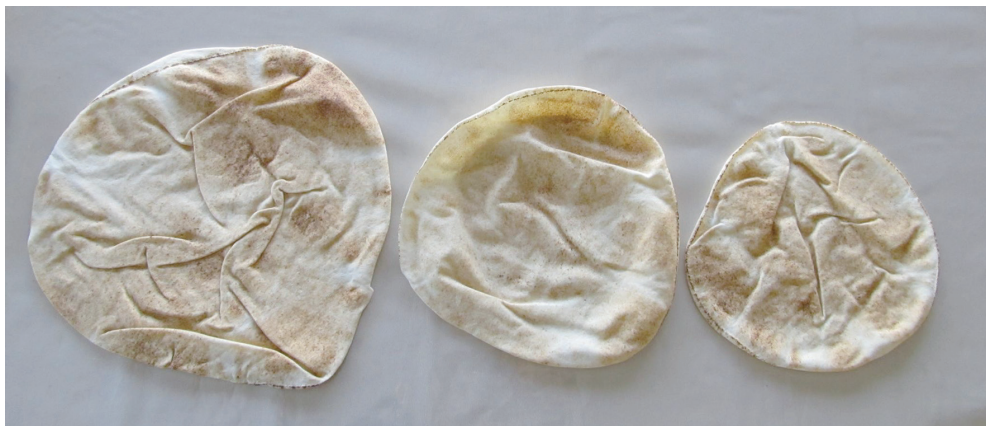
Figure 3 Photograph of white Arabic/pita. The average sodium content of the white Arabic/pita bread is 519 \text{ mg}\cdot 100 \text{ g}^{-1} (1.32% salt).

Recently published results of a survey by Nasreddine et al. [2014] about knowledge, attitudes, and behaviors (KAB) of Lebanese consumers regarding dietary sodium intake demonstrated a poor knowledge of the effects of sodium on health and its sources in the diet. This reflected in unfavorable attitudes and behaviors of the consumers towards reducing their daily sodium dietary intake. Although 78% of the participants linked high dietary sodium intake to poor health, almost half did not know it leads to stroke and heart attacks. Moreover, only 23% correctly recognized processed foods as the main source of dietary sodium. More importantly, only 32% correctly indicated the recommended upper daily intake limit. Furthermore, less than half of the participants (45%) were