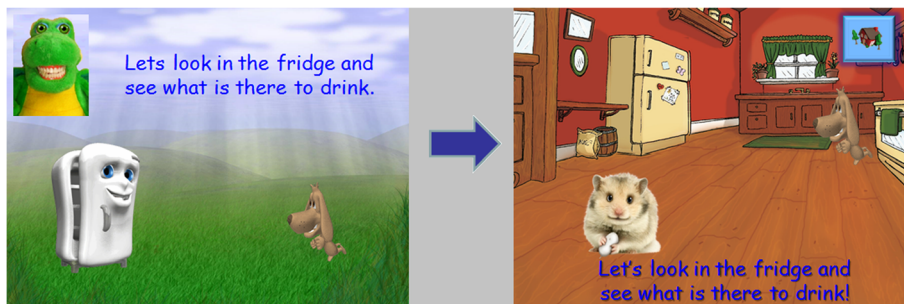
Fig. 1 Video-game modification

themselves. Participants will be able to withdraw from the trial at any time and this will not affect access to their treatment at the hospital.