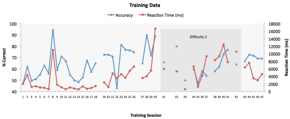
Figure 2. a) TM’s assessment results (accuracy and RT) on “Mom/Not Mom” task across 4 baseline (pre-training) measurements, mid-training (midl), and post-training (post). b) TM’s accuracy on training task across 48 days of training. Lighter shading indicates training at the introductory difficulty level. Darker shading indicates training at a harder level of difficulty. A break in the line indicates a gap of more than 5 days between sessions.