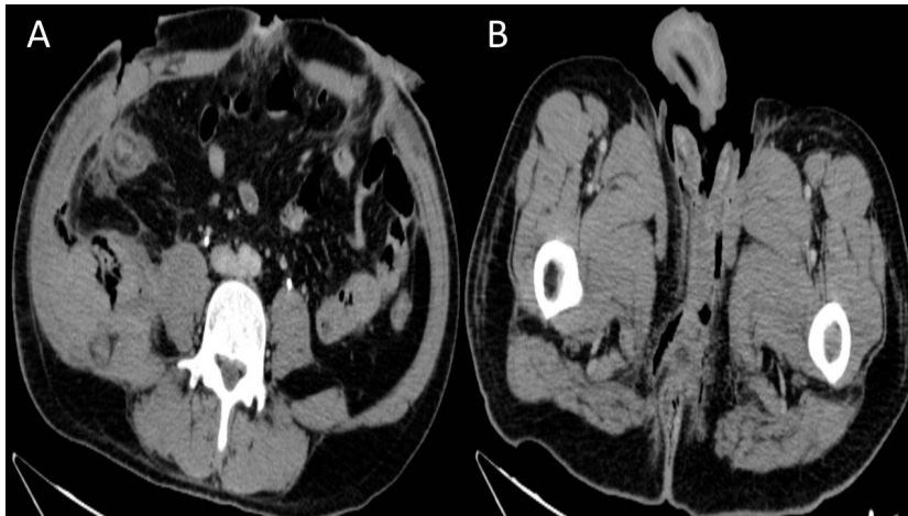
Fig. 1 Abdominal computed tomography of a patient with Fournier's gangrene. (A) Axial CT image showing bilateral abdominal wall defect, air densities on the lateral fascia (on the right), and mild thickening of the plantar fascia. (B) Axial CT image showing air densities and mild thickening of the plantar fascia at the perineal level.

The mean duration of symptoms at presentation was less than 48 hours in 16 (37.2%) patients and more than 48 hours in 27 (62.8%) patients. Delayed admission occurred in all nonsurvivors (100%) and 21 (56.8%) patients in the survivor group.