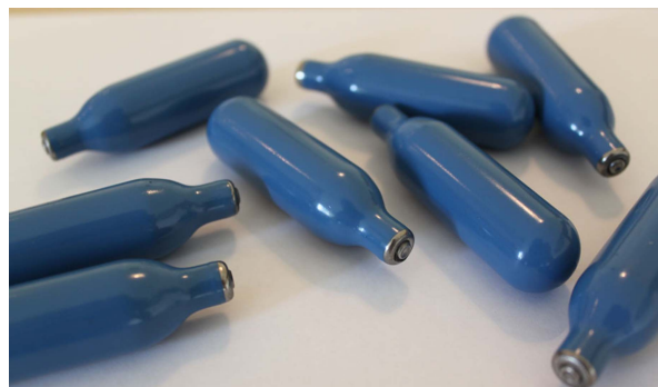
Figure 1 Pressurised whipped cream chargers, known as 'whippets', are a readily available source of nitrous oxide. They are often used to inflate balloons, from which the gas is inhaled.

Humphry Davy first described the anaesthetic properties of nitrous oxide in his book in 1800; already by