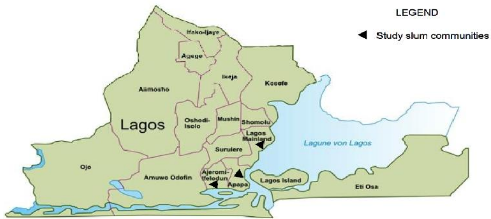
Fig. 2: Map of Lagos state showing the sixteen Local Government Areas

Height was measured with a calibrated pole to the nearest cm. Subjects were requested to stand upright without shoes with their back against the wall, heels together and eyes directed forward. Participant's blood pressure levels were measured in mmHg in a sitting position and after a rest of five minutes using a pre-tested electronic OMRON machine (Omron Corporation, Tokyo, Japan), while random blood glucose was determined using the glucometer (On Call Plus, California, USA).