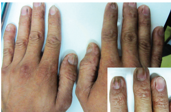
Figure 4: Longitudinal ridging and splitting was seen in some fingernails. Pterygium was visible in the second finger of right hand (insert).