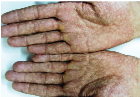
Figure 3: Mottled pigmentation on both palms.