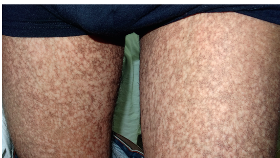
Figure 2: Reticular pigmentation and skin atrophy was visible on both thighs.