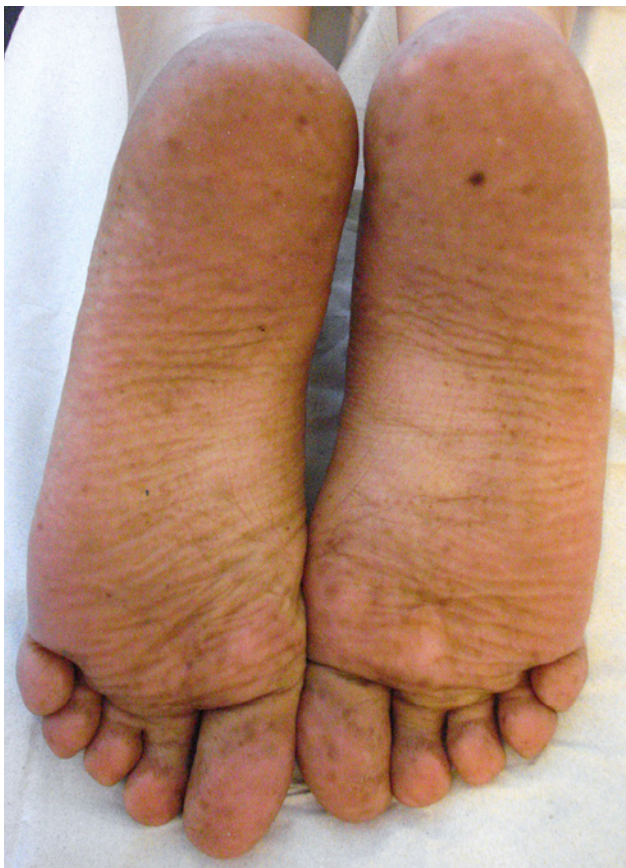
Figure 1. Diffuse hyperpigmentation of the feet localized on the soles at presentation time.

Hyperpigmentation was noticed after two cycles of therapy (cycles consisted of 1250 mg/m 2 twice daily for two weeks, separated by a 7-day interval). Assuming that capecitabine was responsible for the lesions, we enquired whether the patient had ever previously had signs or symptoms of HFS. The patient replied that she had never previously experienced paresthesia, burning pain, erythema, swelling, blistering, desquamation or ulceration of the feet.