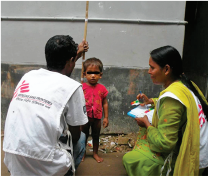
FIGURE 1 Using a height measuring stick to identify children between 65 and 110 cm of height in Kamrangirchar slum, Dhaka, Bangladesh.

located in the most condensed parts of the slum to cover the majority of the population.