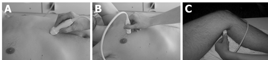
Fig. 1 Examples of used transducer positions. a Transducer placed for subcostal view during FATE. b Transducer placed in an intercostal space at the anterior surface of the chest during FLUS. c Transducer placed at the popliteal crease for assessment of the popliteal vein during LCU

touched the patient's skin for the first time to the examination had been completed and stored on the ultrasound system. The feasibility of the ultrasonographic examinations were assessed according to predefined criteria (see Additional file 1).