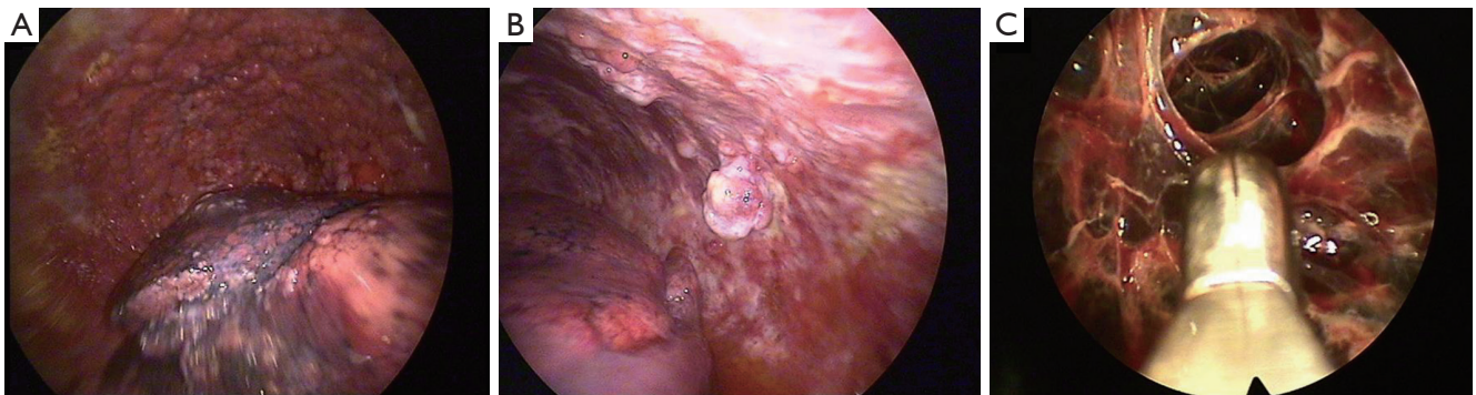
Figure 2 Direct visualisation of the pleura with demonstration of different pathologies. (A) Diffuse parietal pleural nodularity with the deflated lung visible inferiorly. Biopsies confirmed mesothelioma; (B) irregular nodules arising from parietal pleura. Biopsies confirmed adenocarcinoma; (C) closed biopsy forceps adjacent to complex fibrous adhesions.

a combined diagnostic and therapeutic procedure in one setting. Thoracoscopy allows large volume thoracentesis and direct visualisation of the pleura ( Figure 2 ). Multiple biopsies can be taken through a single insertion point and, if necessary, talc poudrage can be performed to prevent recurrence of effusion (54). In some cases of undiagnosed pleural effusions, particularly in early pleural malignancy, radiological evidence of pleural thickening or nodules may be sparse. In such cases the lack of a target would challenge the use of image-guided biopsy; therefore direct examination of collapsed lung, diaphragm, visceral and parietal pleura and the outline of underlying ribs can identify appropriate areas for biopsy (52). Direct visualisation can discriminate between normal and abnormal areas, allowing for targeted biopsy of nodular, thickened or erythematous areas. In the absence of visual abnormality thoracoscopy allows for biopsies to be taken safely from the parietal pleura.