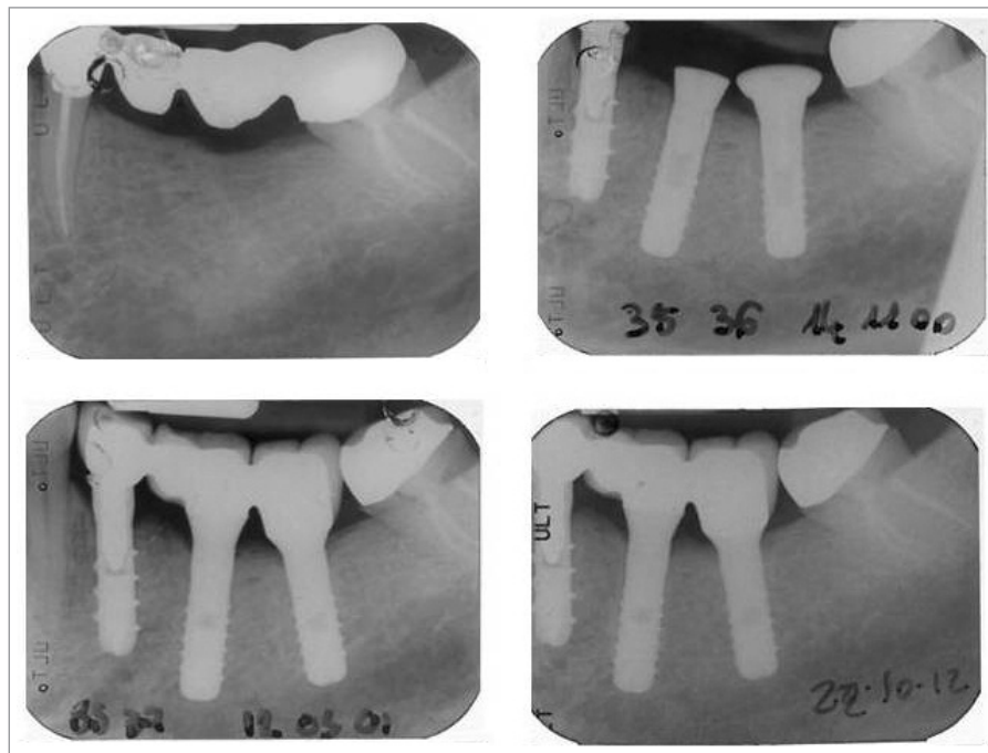
Figure 2. Peri-apical x-rays of asymptomatic, periodontally healthy patient over a period of 6 years.

Note: Implant positions are reported according to the universal numbering system (also known as the “american dental numbering system”)