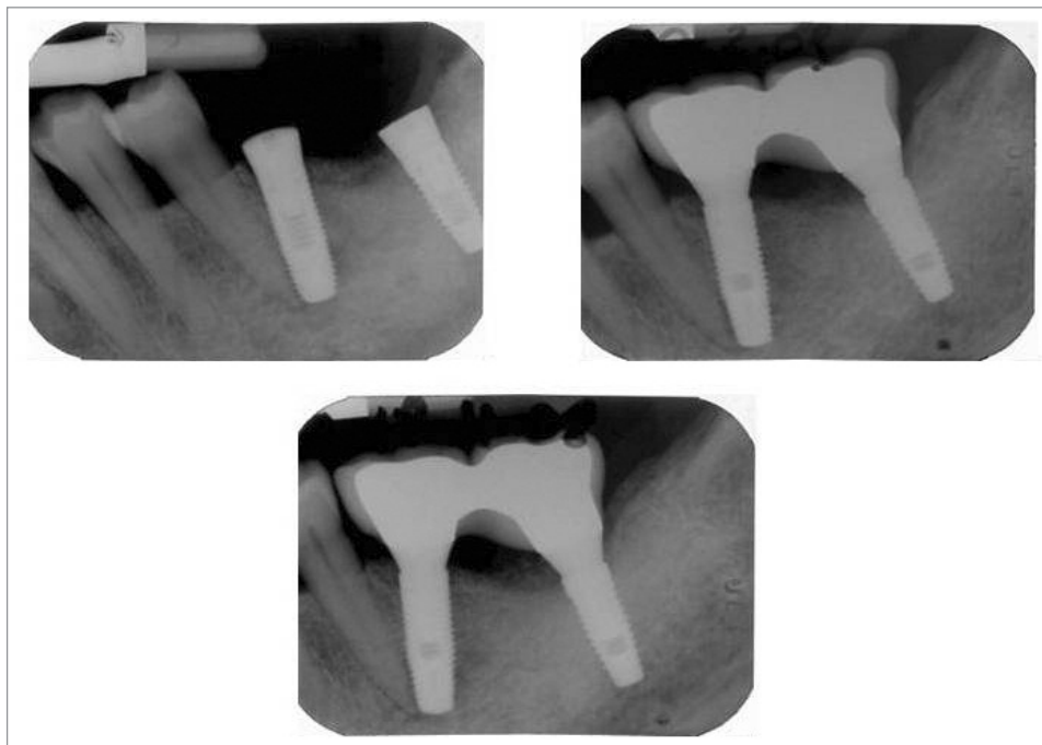
Figure 3. Peri-apical x-rays of a smoker patient previously affected by periodontitis over a period of 7 years.

Note: Implant positions are reported according to the universal numbering system (also known as the "american dental numbering system")