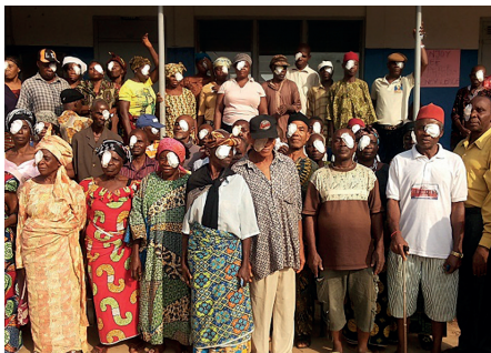
After cataract surgery at Deseret Community Vision Institute. NIGERIA