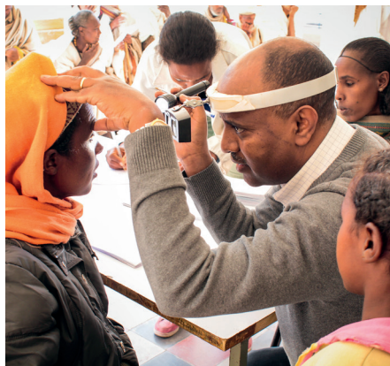
At a screening camp organised by Fitsum Berhan Eye Clinic. ETHIOPIA

poor and those who struggle to come to the hospital, for whatever reason.