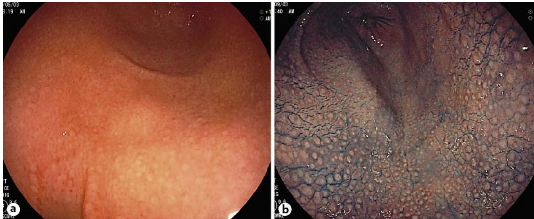
Fig. 1. a White light endoscopy of the antrum showed small, round, yellowish-white nodules, which were the features of H. pylori -infected mucosa. b The nodular pattern can be clearly observed with indigo carmine spreading.

Goji et al.: Helicobacter suis -Infected Nodular Gastritis and a Review of Diagnostic Sensitivity for Helicobacter heilmannii -Like Organisms