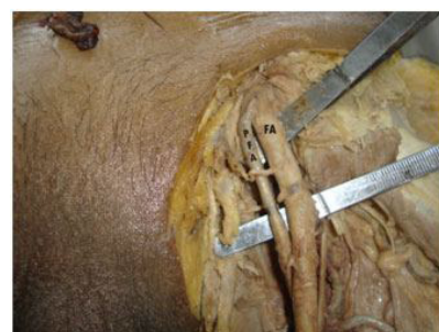
[Table/Fig-3]: High origin of Profunda Femoris artery (PFA) from medial side of Femoral Artery (FA) with all superficial branches and circumflex arteries from PFA, MCFA (medial circumflex femoral artery) & LCFA (lateral circumflex femoral artery) [Table/Fig-5a,b]: Common origin of Profunda Femoris artery (PFA) with two circumflex arteries (MCFA & LCFA) from femoral artery (FA), (A) Typical course of three arteries (B) Lateral circumflex femoral artery (LCFA) with tortuous course in initial part