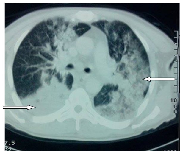
FIG. 2. Chest CT. Bilateral interstitial and alveolar interstitial with lower right lobar alveolar consolidation.

The evolution was marked by the early death in two patients (inter- hemispheric cerebral hematoma complicated with coma and respiratory distress in one case, and extensive pneumonia with respiratory distress in one case) and persistent sequelae in two other patients (PFP in two cases and hearing loss in one