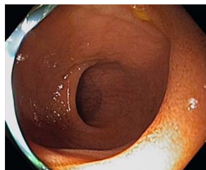
Fig. 3 Terminal ileum.

pared with the targeted ADR of at least 20% [11], raise the question of whether the advised ADR should be adjusted.