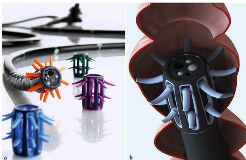
Fig. 1 Endocuff device used during screening for colorectal cancer. a The device is attached like a cap to the distal tip of the colonoscope. b The Endocuff is used to optimize visualization behind the folds of the colon and increase the adenoma detection rate..

ly higher ADR with the Endocuff than with standard colonoscopy (56% vs. 42%; P=0.001 ) [6].