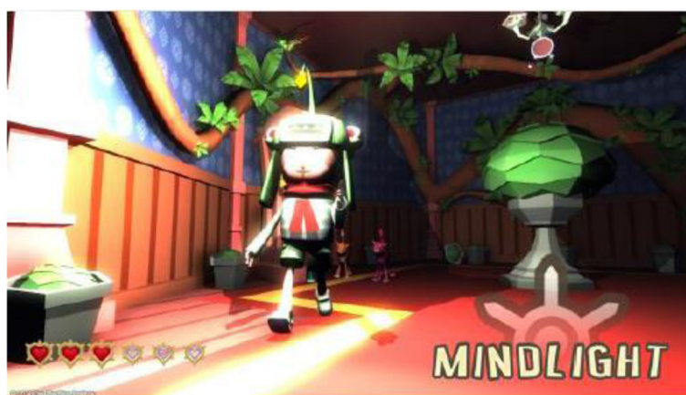
Fig. 2 Relaxation mechanic Mindlight: remain calm to enlighten environment

The gaming sessions will be led by qualified therapists, or by master students who are supervised by qualified therapists. In session 1, the therapist starts with psychoeducation on anxiety. After that, the anxiety of the child will be discussed, the therapist will explain the game and eventually the therapist will clarify that this game is focused on decreasing the anxiety of the child. Then, the child will play the game for approximately 40 min. After playing the game, the therapist will ask the following standardized questions: 1) How did the gaming go