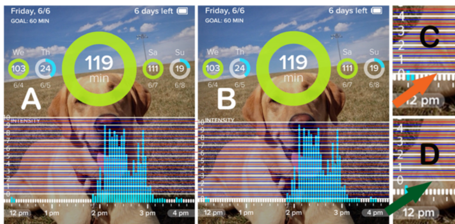
Fig. 3 Measuring activity intensity using Whistle screenshots - Screenshots of the Whistle application display imported into Photoshop. a The grid for measurement of activity intensity is overlaying the activity bars in an incorrect position. b The grid is correctly aligned at the tip of the white 'no activity'/white bars and at the bottom of the word 'Intensity'. Enlargement of (c) correct and (d) incorrect alignment of the grid with the 'no activity' bars Activity bars

coefficient 0.81, p < 0.0001 ) at all time points. The correlation for individual dogs ranged from 0.77-0.99 with only 2 dogs having a correlation coefficient less than 0.81. When time points in which no movement was detected in the Actual group were excluded the correlation was 0.78 ( n = 2033 , p < 0.0001 ). When evaluating the total activity data, there was a very strong correlation (Pearson's correlation coefficient 0.921, p < 0.0001 between TAA and TAW).