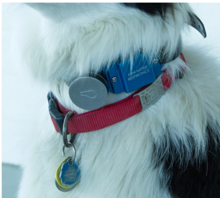
Fig. 1 Whistle and Actical - Picture of a dog wearing the additional collar with the Whistle device (left) and Actical device (right) in its protective casing

To access the Actical data, the device was removed from the collar and the device removed from the protective casing. The Actical was then connected to a PC