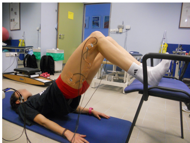
Figure 6 Hamstring bridge exercise.

Participants start lying in a prone position (Figure 9). A fitball is held at the position of the gluteal muscles, and the subject flexes and hits the ball with the heel. The right and left legs are alternated as rapidly as possible. One repetition is hitting