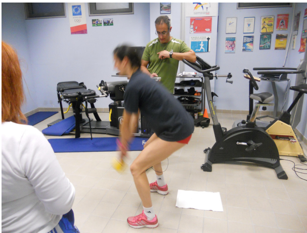
Figure 3 Kettle bell swing exercise.

in this position with the knees straight. Each knee is flexed alternately with a slow rhythm ensuring that the movement is controlled. One repetition equates to a single knee flexion on each side. This is an open kinetic chain knee dominant exercise.