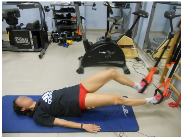
Figure 5 TRX exercise.

Note: TRX is a suspension trainer workout system that leverages gravity and your bodyweight.