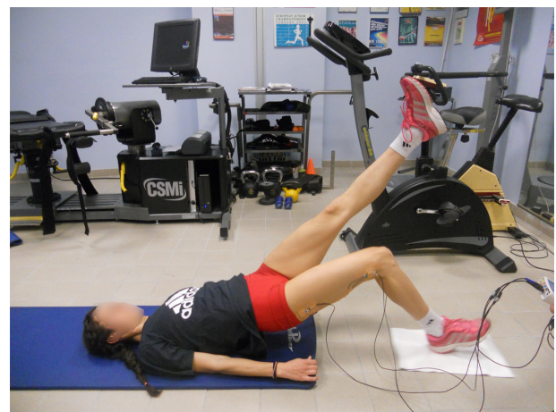
Figure 10 Slide leg exercise.

The mean EMG value was determined for each exercise by averaging the values for ten repetitions of each exercise. Mean EMG values were compared between the two recording