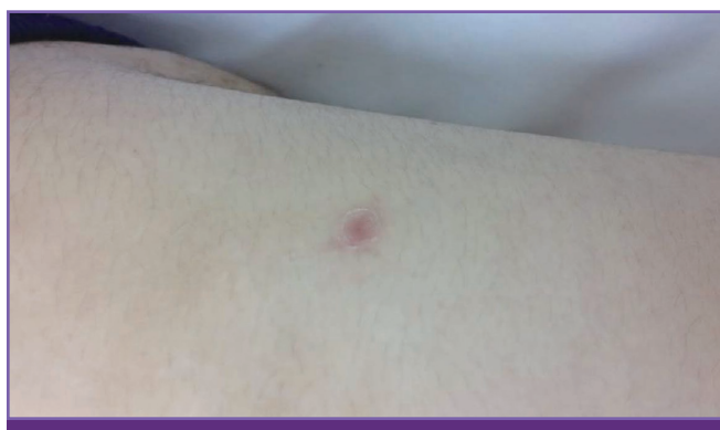
Figure 1. Eschar in right flank.