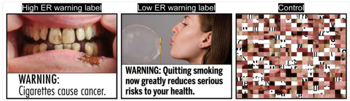
Figure 1. Examples of stimuli used in the graphic labels functional MRI (fMRI) task.