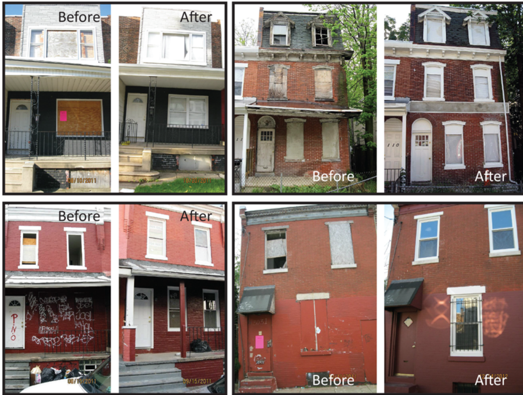
Fig 1. Before and After Photos of Renovated Vacant Properties. This figure shows four properties that received doors-and-windows remediation. Pink posters on doors of properties shown in the upper left- and lower right-hand quadrants notify the owner of a date by which the structure must be in compliance or face penalty.