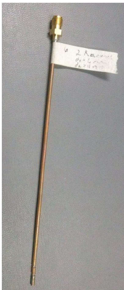
Figure 1 Applicator for microwave ablation.