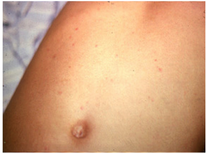
FIG 2 Rose spots on the abdomen of a patient with typhoid fever. (Reprinted from reference 603.)

After ingestion of Salmonella serovar Typhi or Paratyphi A, an asymptomatic period follows that usually lasts 7 to 14 days (range, 3 to 60 days). Human challenge models, both in the 1950s to 1970s (49) and more recently (50), contributed to the understanding of incubation and very early symptoms in typhoid fever. These studies have shown that a higher infecting dose is associated with a higher attack rate and a shorter interval to bacteremia but has no influence on the time to symptom development or disease severity. Recent human challenge studies have also demonstrated that a proportion of patients develop a subclinical or asymptomatic bacteremia and that fecal shedding can occur in the period before symptom development, during primary infection (51). As symptomatic disease develops, the predominant symptom is the fever (40–42, 52). The temperature rises gradually during the first week of the illness and reaches a high plateau of 39 to 40°C the following