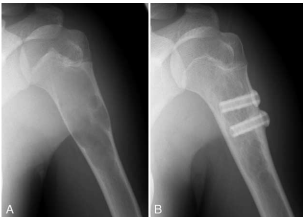
FIGURE 3. Case 40. (A) SBC of the humerus of a 15-year-old boy. (B) Eight months after surgery, the cyst has completely healed. SBC = simple bone cyst.