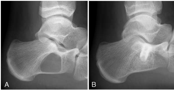
FIGURE 2. Case 27. (A) SBC of the calcaneus of a 14-year-old girl. (B) Five months after surgery, the cyst has completely healed. SBC = simple bone cyst.