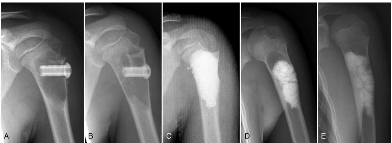
FIGURE 4. Case 20. SBC of the humerus of an 8-year-old boy. (A) An HA pin has been inserted into the cyst cavity after curettage and drilling. (B) Nine months after initial surgery, the cyst has enlarged. (C) A reoperation was performed, with curettage and artificial bone grafting. (D) Recurrence of the cyst occurred in part of the proximal artificial bone 23 months after reoperation. (E) Sixteen months after the third operation, the cyst has completely healed. HA = hydroxyapatite, SBC = simple bone cyst.