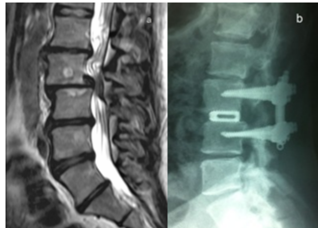
Fig. 1. Case 15. A 41 year old man with Grade II degenerative spondylolisthesis, Level L3-L4. (a), the preoperative sagittal T2-weighted MRI illustrates the spondylolisthesis and the retropulsion of the intervertebral disc. (b), the 48-72 h postoperative sagittal radiograph shows PLIF + IPLF, with restoration of the disc space height and improvement of the spondylolisthesis.

The clinical evaluation of preoperative and postoperative back pain and sciatica was carried out by means of the visual analogical scale (VAS) of pain, a subjective unidimensional scale that extends from 0-10, with "0" as the absence of pain and "10" as the existence of the maximum pain. 9 The total clinical result