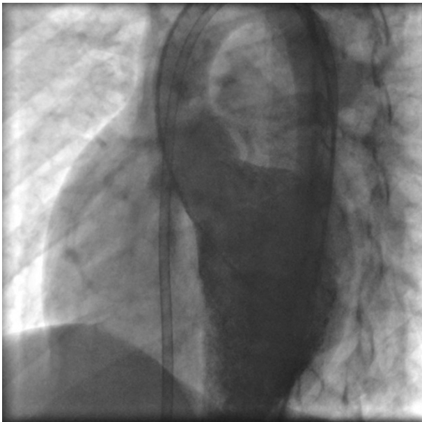
Figure 2. Left Ventriculogram After Advancing of an Appropriately Sized Sheath From the Femoral Vein Across the VSD

chosen ADO was at least 2 mm larger than the narrowest of the measured VSD diameter in right side by ventriculogram. Subsequently, a 0.035 inch Terumo glide wire was placed across the VSD using a 4 or 5 French curved end-hole catheter (Judkins right coronary, Cobra) or manually cutting a pig-tail catheter to adjust the needed angle from the left ventricle (LV) into either branch of the pulmonary artery, and superior or inferior vena cava. At the next step the wire was snaring with Amplatz Gooseneck Snare and withdrawn to exteriorize it through femoral artery and establishing a long wire loop from the femoral vein to the femoral vein. Over this wire, an appropriate size dilator and long sheath was advanced from the femoral vein across the VSD by standard protocol all the way until the tip of the sheath was in the descending aorta (Figure 2).