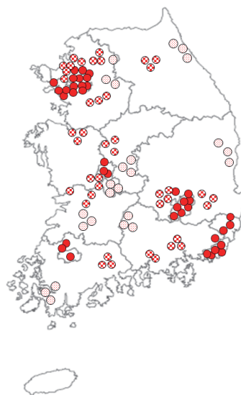
Figure 1. Distribution of 102 sampling sites (filled circle, metropolitan; check pattern circle, urban; dot pattern circle, rural).

The adult subjects were selected through composite sampling methods. The final sampling unit of this survey was household members. In the first step of the sampling, we conducted stratified probability sampling by region (15 metropolises and prov-