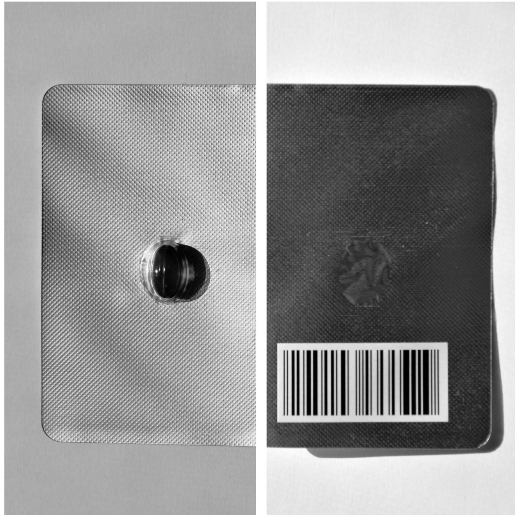
Figure 1. Blister pack containing PEG marker capsule and barcode identifying its unique constituents.