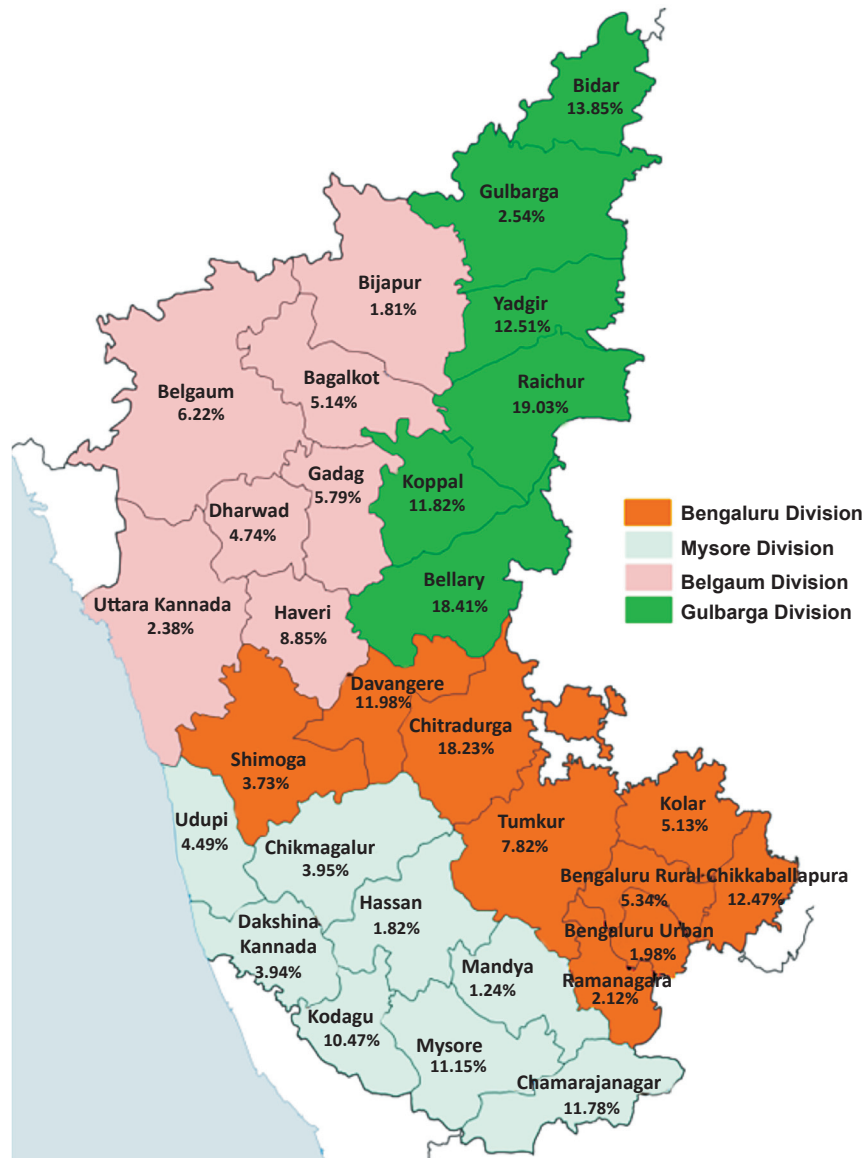
Fig. 1. Map of Karnataka showing tribal population as percentage of total population in each of its 30 districts.

Currently there are 50 Scheduled Tribes (ST) in Karnataka notified according to the Constitution (Scheduled Tribes) Order (Amendment) Act 2003 2 . The names of these tribes, along with their population in the State and districts mostly inhabited by them are listed in the Table. As many as 14 of these tribes are either exclusively found in Karnataka or are predominant inhabitants of the State.