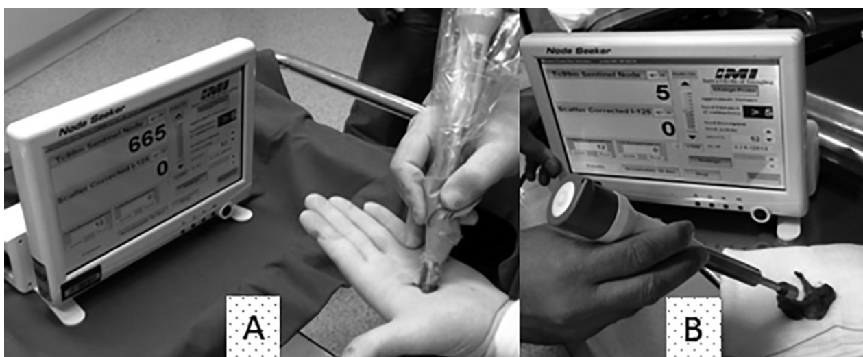
Fig. 3 - The radioactivity of the surgical specimen, although reduced as compared to intraoperative detection, remains totally concentrated on the adenoma (A), with no interference of the thyroid parenchyma (B).

In conclusion, this method allows us to perform surgery with no timetable restriction and to clearly distinguish the radioactivity of parathyroid adenoma from that of the surrounding tissues, including the thyroid radioactivity. We think that this protocol will allow us to reduce the time of hospitalization and costs. It will allow us to technically improve the treatment of parathyroid adenomas and organization of operating theatres.