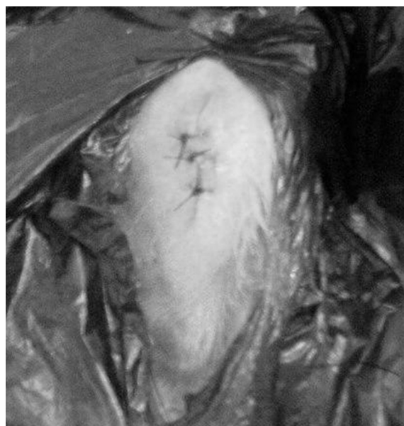
Fig. 3 – Photo of skin suture.

The rabbits were euthanized after 12 weeks of surgery; the animals were anesthetized as described previously and subjected to intracardiac injection of thiopental (5 mL) and potassium chloride (10 mL). The tibial plateaus were resected aseptically and immersed in a flask containing 10% formaldehyde. The vials were labeled for identification of groups and sent to the Clinical Pathology Service, Hospital de Clínicas.