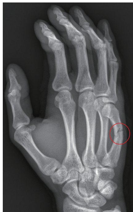
Fig. 1. Preoperative X-ray of the first fracture event. The X-ray shows the fracture of the fifth metacarpal bone shaft of the left hand (red circle).

A 30-year-old male visited Bucheon St. Mary's hospital with a swelling on his left hand after a slip-and-fall injury. He was diagnosed with a left fifth metacarpal bone fracture by hand computed tomography (CT) and X-rays (Fig. 1). The first operation was performed 8 days after the injury, and open reduction was performed. To stabilize the fracture segments, a bioabsorbable plate and screws (Linvatec Biomaterials Ltd., Tampere, Finland) were used for internal fixation. Although the 1-year follow-up was uneventful, the patient visited us with swelling on the previous operation site. Physical exam showed just the swelling of the soft tissue of the operation site without any fluctuation, heat, or erythema. We recommended further evaluation such as an imaging study, but the patient refused to undergo it. Therefore, we decided to observe the patient without administering any medication because there was no evidence of infection. Four months later, the patient visited us again because of another trauma at the same site. Physical examination, CT, and X-rays were conducted, and the patient was diagnosed with a refracture of the fifth metacarpal bone with increased soft tissue swelling as compared to when we first noticed it 4 months previously (Figs. 2, 3). We